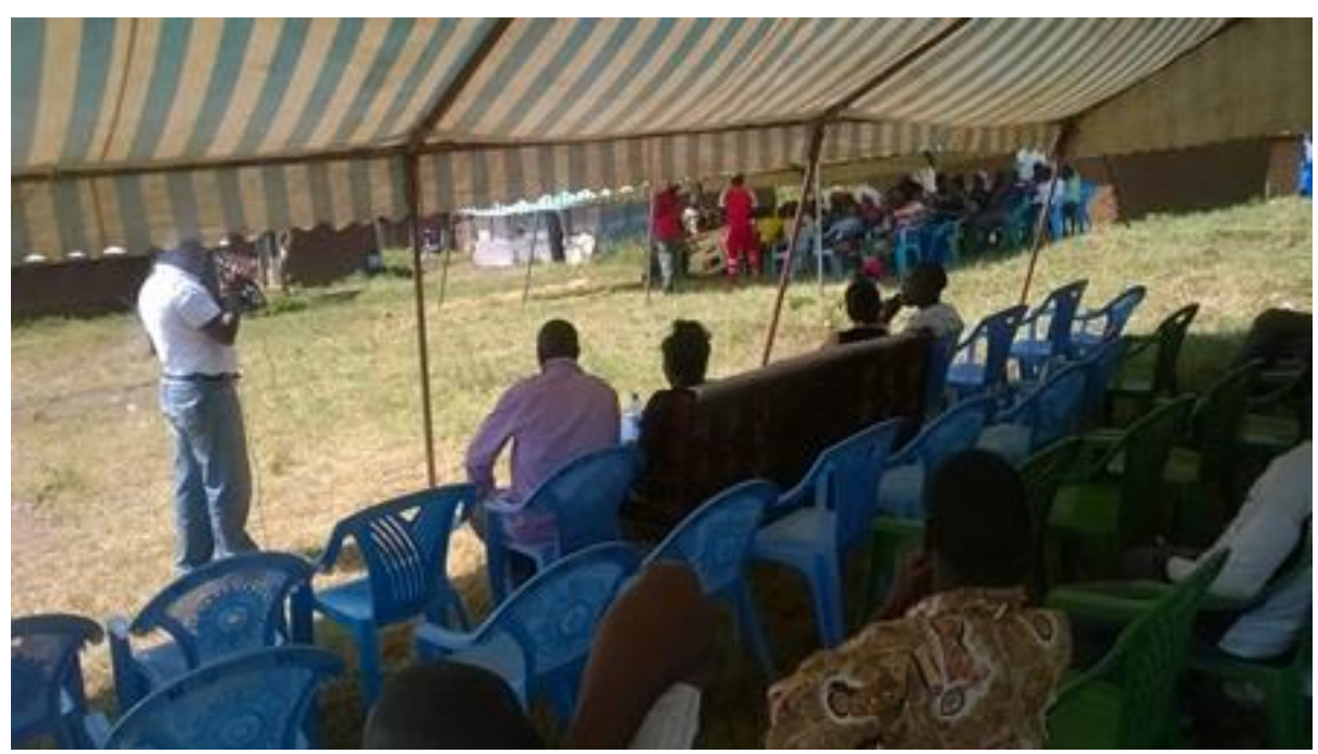
Plate 6.1: Participanting for Public Participation and Consultation assemblying

The photos below as well as the summary of issues discussed by the various stakeholders are shown below.