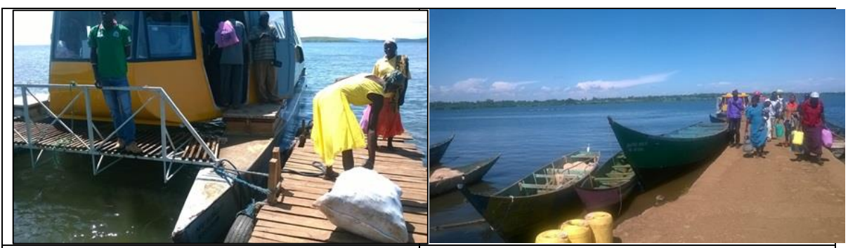
Photo 4.3: Water bus used in Mageta Island for transportation over the Lake