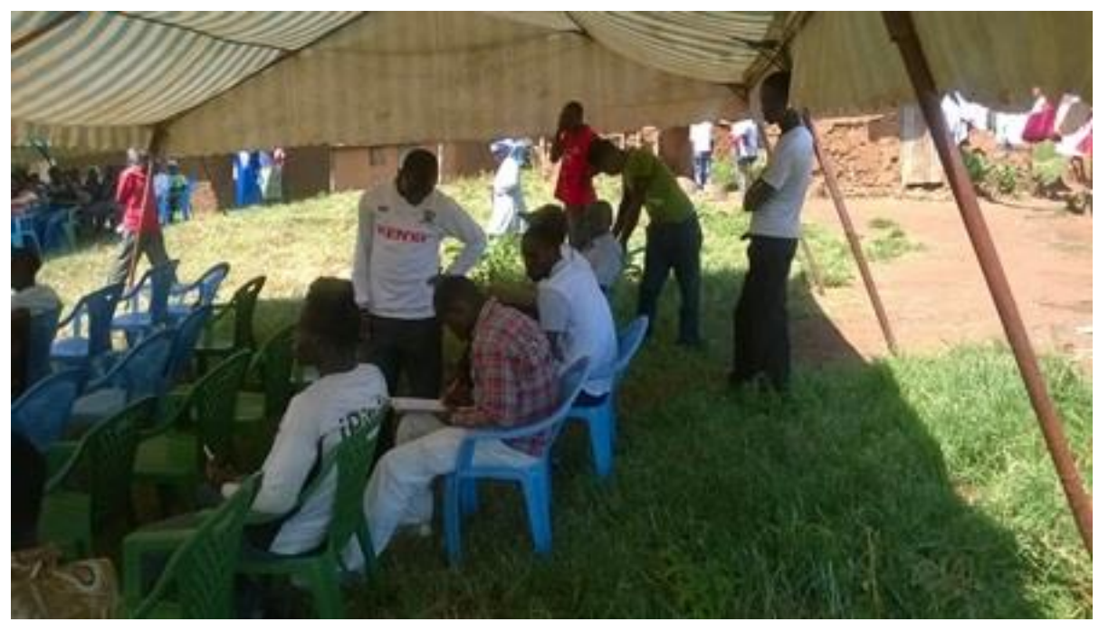
Plate 6.2: One of the participants filling out his details on the attendance list