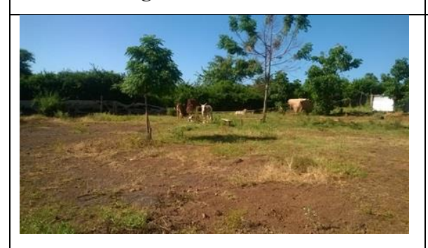
Photo 4.5: Livestock keeping observed on the island used for subsistence farming