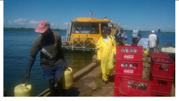
Photo 4.6: Some of the trading commodities arriving in the main dock at th Mageta Island